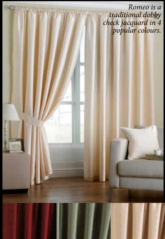
Romeo is a traditional dobby check jacquard in 4 popular colours.

Both these designs are printed on the same heavyweight 52% polyester 48% cotton fabric as the plain Panama Curtains and they certainly have the wow factor. These eyelet curtains are available in the three more popular sizes and each design is available in two colours – Crimson and Duck Egg for Florentine and Black and Duck Egg for Jumeirah.