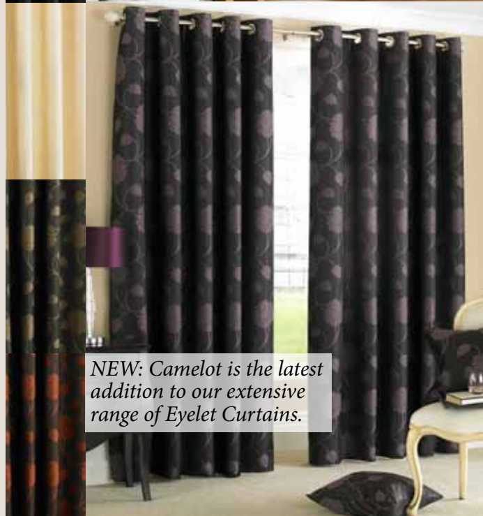
NEW: Camelot is the latest addition to our extensive range of Eyelet Curtains.