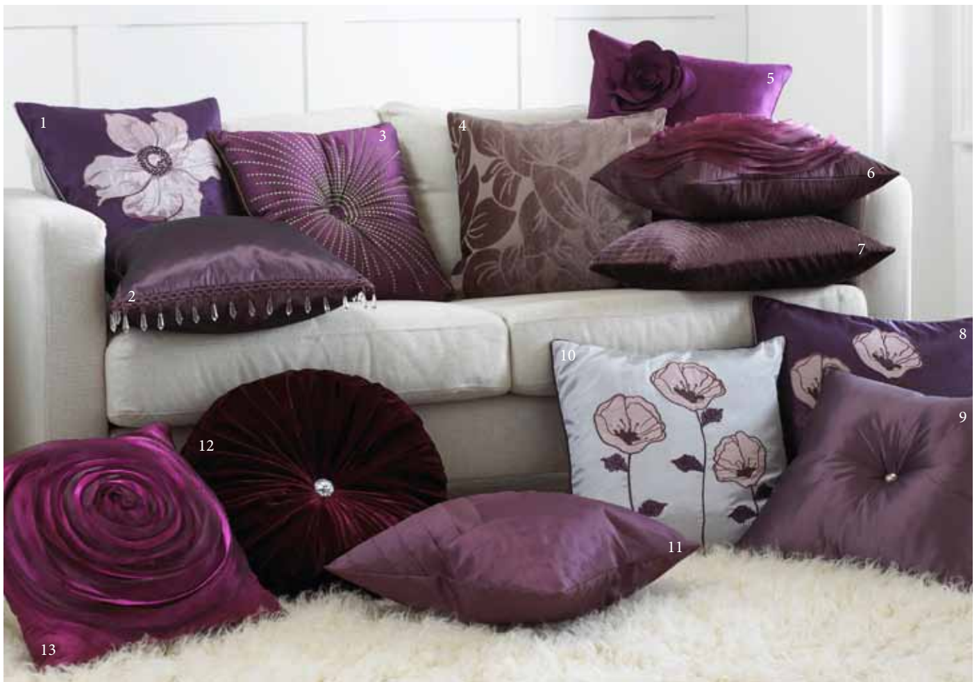
Damson Collection - 1: Poppet; 2: Teardrop; 3: Echo; 4: Glendale; 5: Lilly; 6 & 13: Vortex; 7: Belmont; 8 & 10: Poppet Trio; 9: Desire; 11: Harlequin; 12: Paris