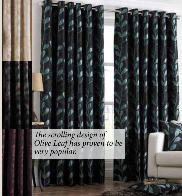
The scrolling design of Olive Leaf has proven to be very popular.

Keep an eye out later on for even more of our fantastic eyelet and pencil pleat curtain designs.