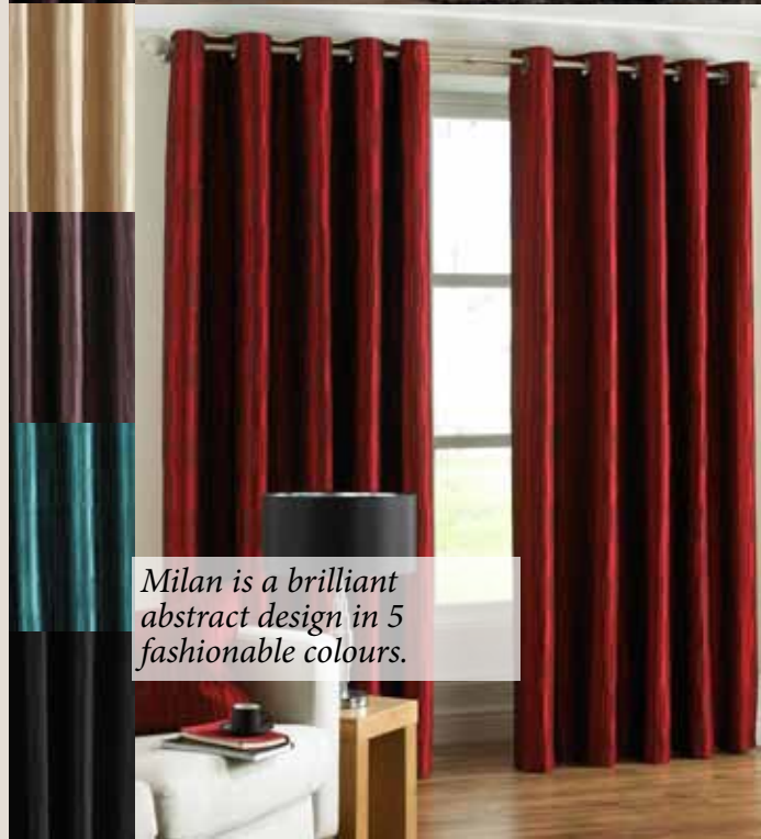
Milan is a brilliant abstract design in 5 fashionable colours.