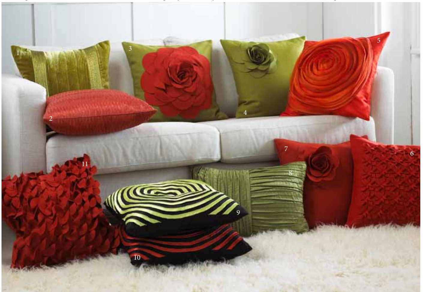
Lime/Paprika Collection - 1: Stateside; 2: Nevada; 3: Rhapsody; 4 & 7: Lilly; 5: Vortex; 6: Yacca; 8: Mancini; 9 & 10: Spiral; 11: Amalfi