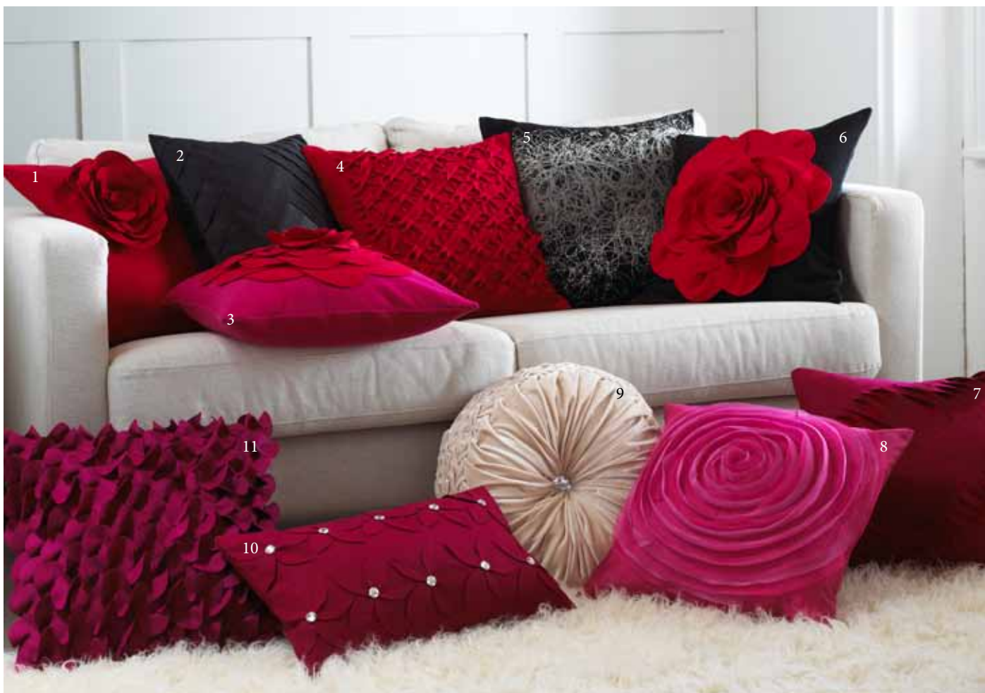
Fuchsia, Red & Black Collection - 1: Lilly; 2: Harlequin; 3 & 6: Rhapsody; 4: Yacca; 5: Ying; 7: Ventura; 8: Vortex; 9: Paris; 10: Crystal Daisy; 11: Amalfi